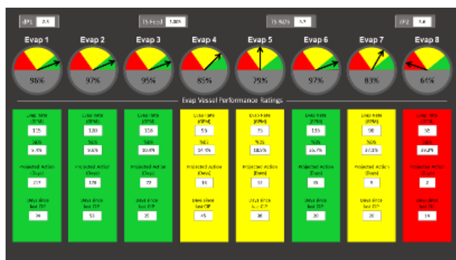
Figure 2: Standardized Graphic User Interface (GUI)

The IVAP system includes the option to install a customizable graphic user interface (GUI), utilizing producer needs directly on the producer's DCS (see Figure 1). The IVAP GUI highlights key operational details and provides a snapshot of the evaporator system performance. This can simplify decision-making and reduce the need to review multiple inputs while providing operations staff with actionable data.