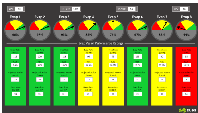
Figure 2: Standardized Graphic User Interface (GUI)

The IVAP system includes the option to install a customizable graphic user interface (GUI), utilizing producer needs, directly on the producer's DCS (see Figure 1). The IVAP GUI highlights key operational details and provides a snapshot of the evaporator system performance. This can simplify decision-making and reduce the need to review multiple inputs while providing operations staff with actionable data.