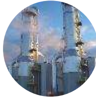
Zero liquid discharge