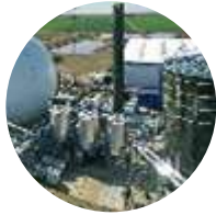
Waste to energy