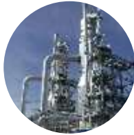
Thermal separation tech