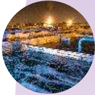
Industrial process enhancement