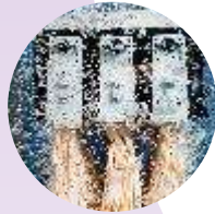
Membrane separation tech