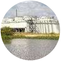
Water treatment chemistry