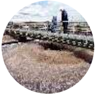
Industrial water treatment

Backed by digitally- enabled technologies & services