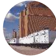
Mobile & outsourced water